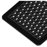
Vision Express Grill