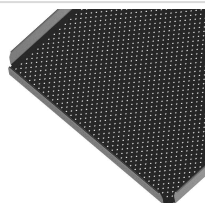
Perforated aluminium sheet, teflon coated