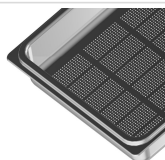
GN container Stainless steel perforated