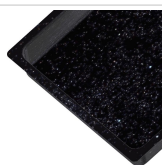
Enameled GN container