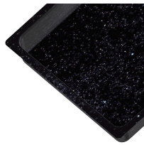
Enameled GN container